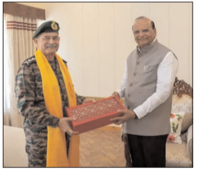
Himalayan Mail News JAMMU, JUN 26

Chief of Army Staff Gen Uday Shankar today called on Ladakh LG Vinit Kumar Saxena at Raj Niwas in Leh, during his visit to the Union Territory. His visit to Ladakh comes amid the Army's continued focus on maintaining operational preparedness and promoting close coordination with