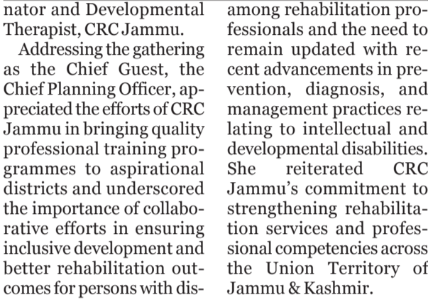
During the technical sessions, valuable insights on contemporary practices and emerging developments in the management of intellectual and developmental disabilities were highlighted. Experienced rehabilitation professionals and subject experts, while speaking on the occasion, covered various aspects related to the prevention, diagnosis, assessment, intervention, and management of intellectual and developmental disabilities. The sessions provided participants with evidence-based knowledge, practical strategies, and updates on recent developments in the field.