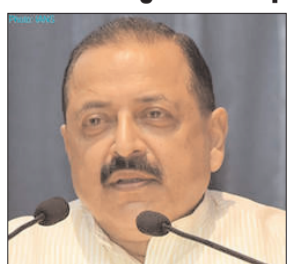
NEW DELHI, JUN 16: Union Minister Jitendra Singh, who today inaugurated pre-retirement counselling workshop, said that the governance and pension reforms initiated by Prime Minister Narendra Modi during the 12 years were reaching a wider section of employees and pensioners