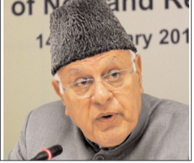
Himalayan Mail News JAMMU, JUNE 10

Prime Minister Narendra Modi had told Jammu and Kashmir Chief Minister Omar Abdullah that he would fulfil his promise of statehood to Jammu and Kashmir, National Confer