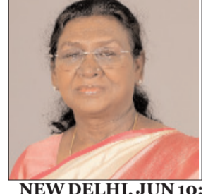
NEW DELHI, JUN 10: President Droupadi Murmu on Wednesday congratulated Prime Minister Narendra Modi on the unique honour of serving as the longest continuously elected PM of the country and said the