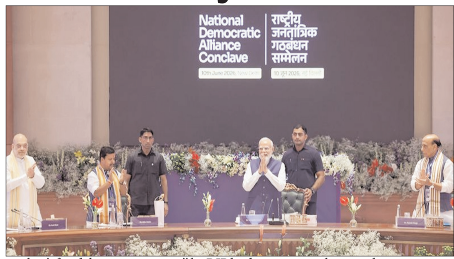
was that it freed the country from the Congress' "vicious trap".

Modi also said a big success of 12 years of NDA rule