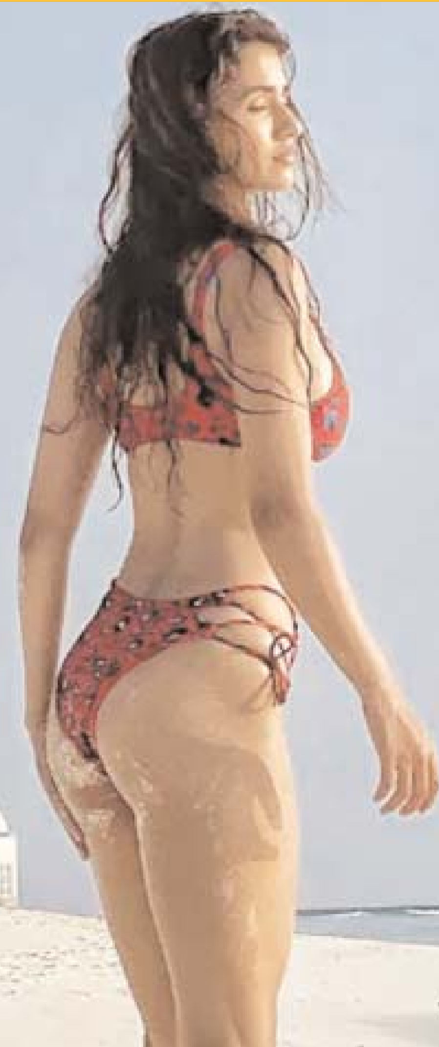
Disha Patani's HOTTEST bikini photos from her Maldives Vacation

Their camaraderie became even more visible to audiences through their appearances on OTT show "Fabulous Lives of Bollywood Wives".