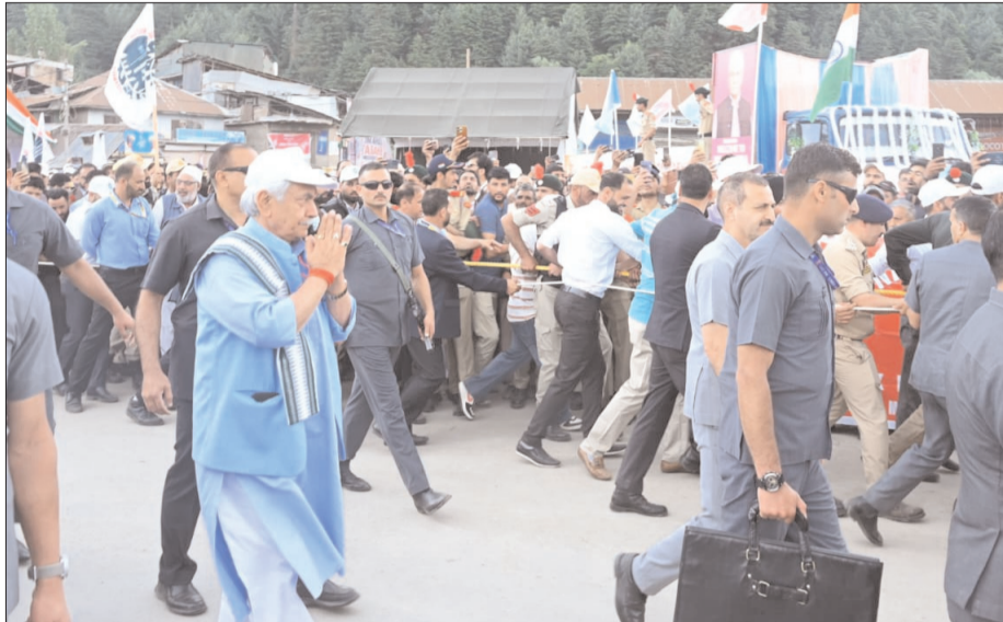
company of terror.

His statement - illegal drugs & terrorism are a combined force of destruction - has been widely hailed. As per his assertions, drug trafficking provides the blood money that fuels terrorism, implying that drug networks act as subsidiary, funding the parent