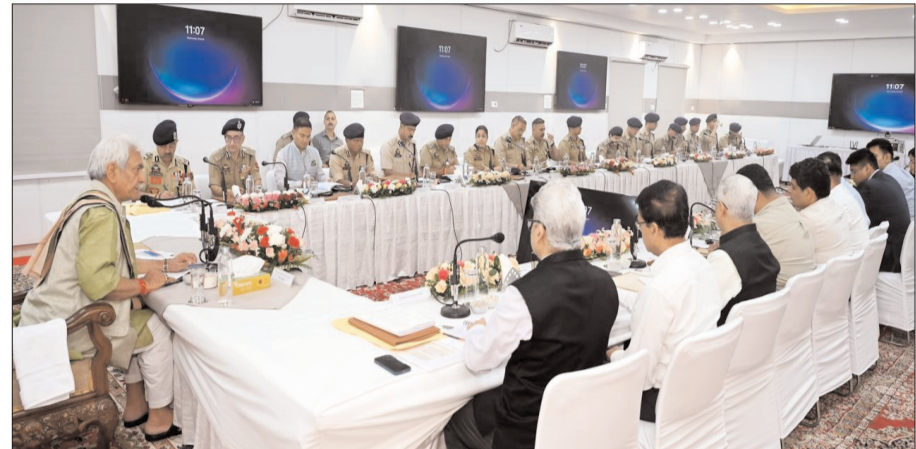
JAMMU, APR 29

In a high-level security review meeting held here today, LG Manoj Sinha directed the authorities concerned to fortify security grid on the eve of forthcoming Shri Amarnathji Yatra in South Kashmir Himalayas. He also enquired about the progress on 'Nasha Mukht J&K Abhiyaan'.