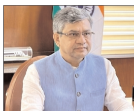
Himalayan Mail News JAMMU, APR 29

Union Railways Minister Ashwini Vaishnav is all set to flag off a 20-coach Vande Bharat Express train between Jammu and Srinagar on Thursday, while the services for the general public Cont. on P9 >