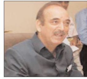
Himalayan Mail News JAMMU, APR 22

Veteran political leader Ghulam Nabi Azad today remembered the victims of the Pahalgam terror attack on its first anniversary, paying tributes to those killed