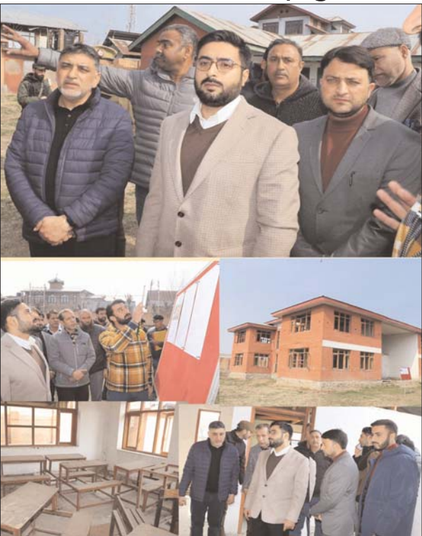
On the occasion, the Deputy Commissioner took stock of the ongoing works and inspected various sections of the building.