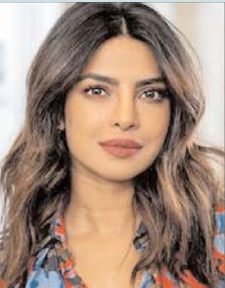
plorer embarking on a mission that transcends time itself. Every epic needs a formidable villain, and Varanasi delivers Prithviraj Sukumaran as the antagonist, Kumbha.