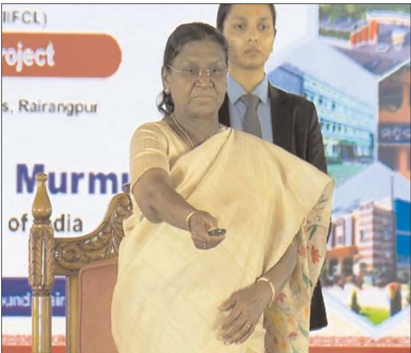
President Droupadi Murmu laying the foundation stone for a 360-seated Girls' Hostel at Rairangpur Women's College, Rairangpur Block, Mayurbhanj District, Odisha on 04.02.2026.

The Hon'ble President of India, Smt. Droupadi Murmu laid the foundation stone for the construction of a 360-seated Girls' Hostel at Rairangpur Women's College, Rairangpur Block, Mayurbhanj District, Odisha on 04.02.2026. The hostel project with an estimated cost of ₹10.23 crore is being undertaken under the Corporate Social Responsibility initiative of NHPC Limited, a Navratna Public Sector Enterprise under Ministry of Power, Government of India. The project is being implemented through Hindustan Steelworks Construction Limited (HSCL), a subsidiary of NBCC (India) Limited in coordination with the Mayurbhanj Dis-