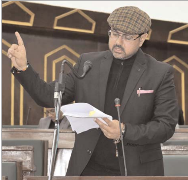
Parkash Ganga. The Minister further said that an amount of Rs.150 crore has been approved