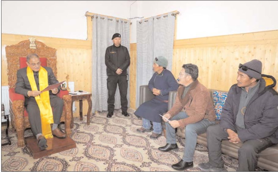
dharamshala/sarai at Khaltsi.

A delegation from the Drikung Kagyud Welfare Society, Leh, requested allotment of land for the construction of a